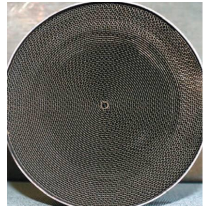
Diesel Oxidation Catalyst